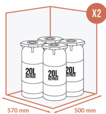
JUSQU'À 8 X 20 LITRES KEYKEG