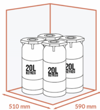
JUSQU'À 4 X 20 LITRES KEYKEG