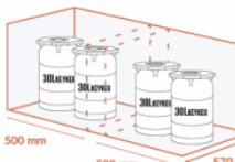
500 mm 500 mm 570 mm JUSQU'À 2 X 2 X 30 LITRES KEYKEG