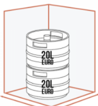
610 mm 500 mm JUSQU'À 2 X 20 LITRES EURO SUPERPOSÉS