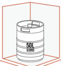
610 mm 500 mm JUSQU'À 1 X 50 LITRES EURO