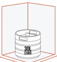
425 mm 510 mm JUSQU'À 1 X 30 LITRES EURO