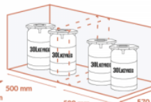
500 mm 500 mm 570 mm JUSQU'À 2 X 2 X 30 LITRES KEYKEG